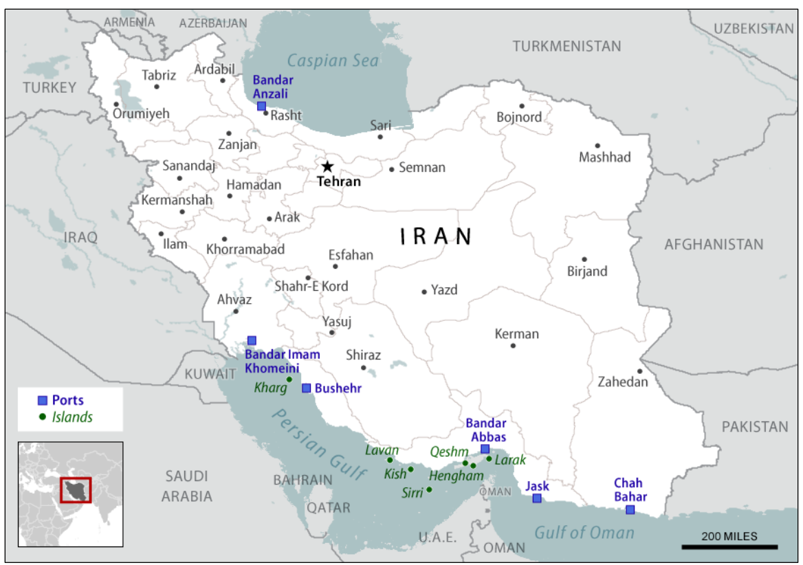
Figure 2. Iran, the Persian Gulf, and the Region