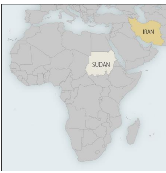
Figure 6. Sudan

The overwhelming majority of Muslims in Africa are Sunni, and Muslim-majority African countries have tended to be responsive to financial and diplomatic overtures from Iran's rival, Saudi Arabia.