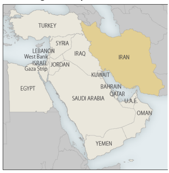
Figure 2. Map of Near East

Iran has a 1,100-mile coastline on the Persian Gulf and Gulf of Oman, and exerting dominance of the Gulf has always been a key focus of Iran's foreign policy—even during the reign of the Shah of Iran. In 1981, perceiving a threat from revolutionary Iran and spillover from the Iran-Iraq War that began in September 1980, the six Gulf states formed the Gulf Cooperation Council alliance (GCC: Saudi Arabia, Kuwait, Bahrain, Qatar, Oman, and the United Arab Emirates). U.S.-GCC security cooperation expanded during the 1980-1988 Iran-Iraq War and became more institutionalized after the 1990 Iraqi invasion of Kuwait. Prior to 2003 the extensive U.S. presence in the Gulf was also intended to contain Saddam Hussein's Iraq, but, with Iraq militarily weak since the fall of Saddam Hussein, the U.S. military presence in the Gulf focuses on containing Iran and conducting operations against regional