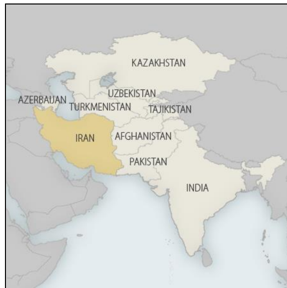
Figure 3. South and Central Asia Region

Most of the Central Asia states that were part of the Soviet Union are governed by authoritarian leaders. Afghanistan remains politically weak, and Iran is able to exert influence there. Some countries in the region, particularly India, seek greater integration with the United States and other world powers and tend to downplay cooperation with Iran. The following sections cover those countries in the Caucasus and South and Central Asia that have significant economic and political relationships with Iran.