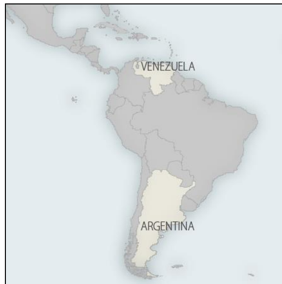
Figure 4. Latin America

Some U.S. officials and some in Congress have expressed concerns about Iran's relations with leaders in Latin America that share Iran's distrust of the United States. Some experts and U.S. officials have asserted that Iran has sought to position IRGC-QF operatives and Hezbollah members in Latin America to potentially carry out terrorist attacks against Israeli targets in the region or even in the United States itself. 148 Some U.S. officials have asserted that Iran and Hezbollah's activities in Latin America include money laundering and trafficking in drugs and counterfeit goods. 149 These concerns were heightened during the presidency of Mahmoud Ahmadinejad (2005-2013), who made repeated, high-profile visits to the region in an effort to circumvent U.S. sanctions and gain support for his criticisms of U.S. policies. However, few of the economic agreements that Ahmadinejad announced with Latin American countries were implemented, by all accounts.