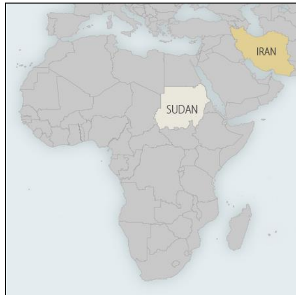
Figure 5. Sudan

Rouhani has made few statements on relations with countries in Africa and has apparently not made the continent a priority. However, the lifting of Iran sanctions could produce expanded