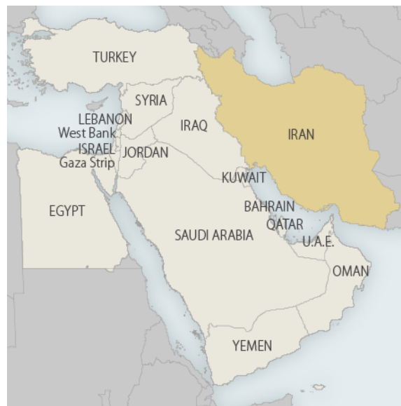
Figure 1. Map of Near East

Iran has a 1,100-mile coastline on the Persian Gulf and Gulf of Oman. The Persian Gulf monarchy states (Gulf Cooperation Council, GCC: Saudi Arabia, Kuwait, Bahrain, Qatar, Oman, and the United Arab Emirates) have always been a key focus of Iran's foreign policy. In 1981, perceiving a threat from revolutionary Iran and spillover from the Iran-Iraq War that began in September 1980, the six Gulf states—Saudi Arabia, Kuwait, Bahrain, Qatar, Oman, and the United Arab Emirates—formed the GCC alliance. U.S.-GCC security cooperation, developed during the 1980-1988 Iran-Iraq War, expanded significantly after the 1990 Iraqi invasion of Kuwait. Prior to 2003 the extensive U.S. presence in the Gulf was also intended to contain Saddam Hussein's Iraq, but, with Iraq militarily weak since the fall of Saddam Hussein, the U.S. military presence in the Gulf focuses on containing Iran and conducting operations against regional terrorist groups. The GCC states host significant numbers of U.S. forces at their military facilities and procure sophisticated U.S. military equipment.