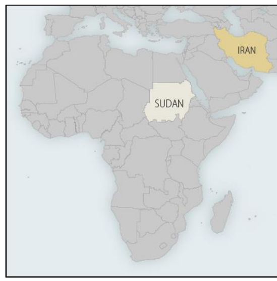
Figure 6. Sudan

The overwhelming majority of Muslims in Africa are Sunni, and Muslim-majority African countries have tended to be responsive to financial and diplomatic overtures from Iran's rivals in the GCC. Amid a Saudi-Iran dispute in January 2016 over the