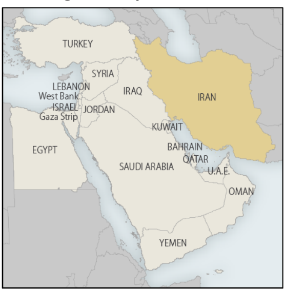
Figure 2. Map of Near East

Iran has a 1,100-mile coastline on the Persian Gulf and Gulf of Oman, and exerting dominance of the Gulf has always been a key focus of Iran's foreign policy, including during the reign of the Shah. In 1981, perceiving a threat from revolutionary Iran and spillover from the Iran-Iraq War that began in September 1980, six Gulf states— Saudi Arabia, Kuwait, Bahrain, Qatar, Oman, and the United Arab Emirates—formed the Gulf Cooperation Council alliance (GCC). U.S.-GCC security cooperation expanded during the 1980-1988 Iran-Iraq War and became formalized after the 1990 Iraqi invasion of Kuwait. Prior to 2003, the extensive U.S. presence in the Gulf was in large part to contain Saddam Hussein's Iraq but, with Iraq militarily weak since Saddam's ouster, the U.S. military presence in the Gulf focuses primarily on containing Iran and